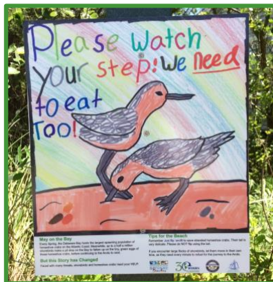
Western Hemisphere Shorebird Reserve Network